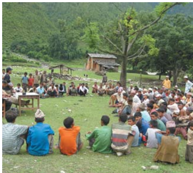
Meeting to discuss the potential impacts of the planned West Seti Hydropower Project, in Nepal, 2007. It is estimated that 15,000 people will be adversely affected by this project.

There is a need to strengthen efforts to evolve such visions, plans and approaches for the entire region and within each country.