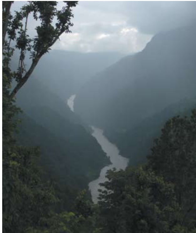
The Karnali River downstream of the planned Upper Karnali project, 2008. Upper Karnali is estimated to cost $454 million (1998 estimate) which is about half the total annual revenue of Nepal.

Internal resources like the PSPD – Public Sector Development Plan (government finances) and special charges like surcharges on power sold (e.g. a 10 paisa per