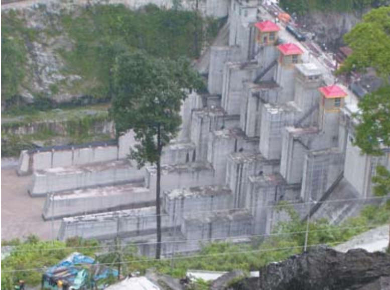
Construction of Teesta V Dam, Sikkim, India, 2008. India, with a huge planned capacity expansion of 50,000 MW in the next 10 years, will require funds to the tune of US$31 billion just in the next five years.

While there are no cost estimates available for many of the projects in Bhutan, with a rule of thumb of about Indian Rs. 5 crores per MW ($1.2 million per MW), 46 we can estimate that Bhutan will need $12 billion in the next