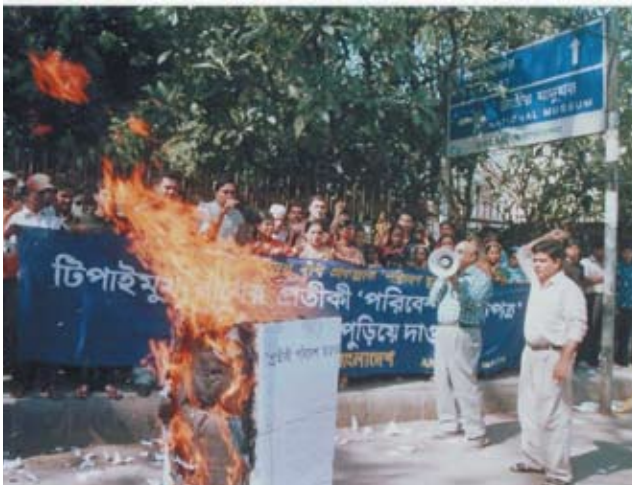
Protest in Bangladesh against the environmental clearance of Tipaimukh Dam in India, 2008. The dam will submerge 292 sq km, affecting 91 villages in India, and people in Bangladesh are concerned that the project will drastically and adversely alter river flow in the downstream region in Bangladesh, with severe social and environmental consequences.

Most of the people living on the banks of rivers in the Himalayan region derive their sustenance from their natural resource base. Agriculture provides food and other needs. The river gives fish, and also provides water for daily use and irrigation. It can also provide transportation routes. Forests provide a variety of things including fruits, vegetables, timber, fodder and in many areas they are also an integral part of the jhum , or shifting cultivation, cycle. 83 This richness and multi-dimensionality of the resource base is often not understood nor taken into account by planners when considering the impacts of projects.