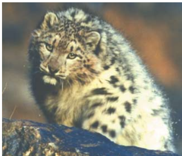
Snow Leopard. Dam building in the Himalayas is a threat to animals and endangered species such as the snow leopard.

The state is situated in the Eastern Himalaya and is the richest biogeographical province of the entire Indian Himalayan zone. The province has been