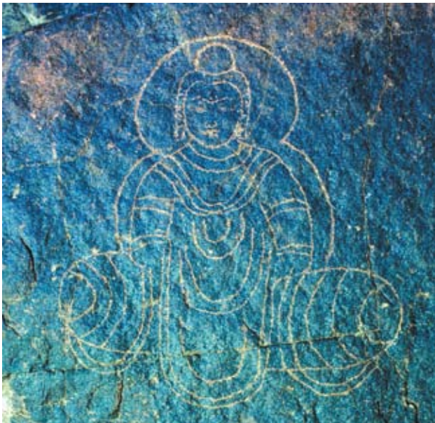
Ancient rock carvings of the Buddha near Diemer-Bhasha Dam site, 2005. A huge treasure trove of rock carvings of ancient times have been found in the area that will be submerged by the reservoir of the planned dam.

The construction of the Talon/Dibang multipurpose project will completely displace our Idu people who are very much dependent on the river as a source of their livelihood. The Idu community’s tradition, custom, faith and beliefs are greatly attached to the river Talon/Dibang...The construction of the dam will herald the end of our culture and tradition as the river Talon/Dibang is as sacred to us, as is the river Ganga to the Hindus...we believe that after death the Igu-myi (1 st Order Priest) Sineru carries forward