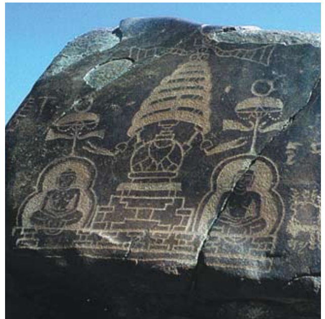
Rock carvings of a Buddha group and stupas near the Diemer-Bhasha Dam site that will be submerged by the reservoir, 2005.