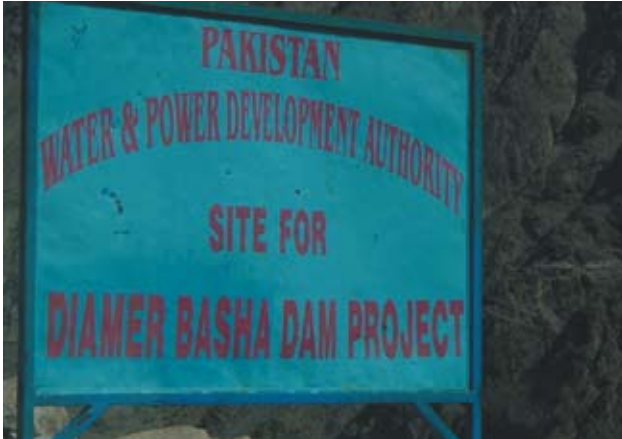
Sign of the planned Diامر-Bhasha Dam in Pakistan, 2007. The government is pushing for the immediate implementation of the massive 4,500 MW Diامر-Bhasha project in Pakistan.

been signed for the 300 MW Upper Karnali and 402 MW Arun-III projects.