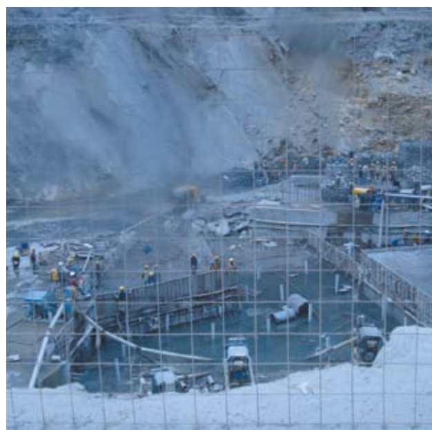
Construction of the 600 MW Loharinag-Pala Hydropower Project on the Bhagirathi River in Uttarakhand, India, 2008.

It should be pointed out that the basis for the estimation of "potential" and the assessment of "feasibility" are unclear. In particular, whether social, environmental and cultural costs are included in determining if the potential is economically feasible is not clear. Given the established procedures of dam building and the gross neglect of these factors in the process, it is highly likely these factors have not been considered.