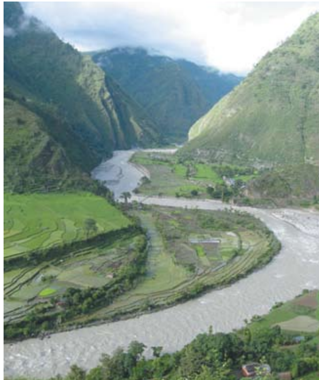
The Seti River near the planned West Seti Dam site in Nepal, 2007. The 750 MW West Seti project is set to begin construction even as the affected people are strongly opposing it.

Recent years have seen a renewed push for building dams in the Himalayas. Massive plans are underway in Pakistan, India, Nepal and Bhutan 6 to build several hundred dams in the region, with over 150,000 Megawatts (MW) of additional capacity proposed in the next 20 years in the four