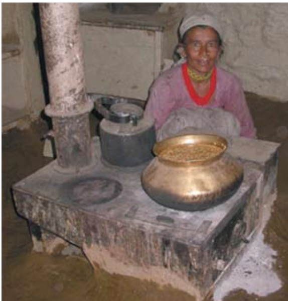
Woman without access to electricity in rural Nepal, 2005. A key issue is that planned hydropower projects in Nepal are not likely to be built in rural areas of Nepal but will export most of the power to India.