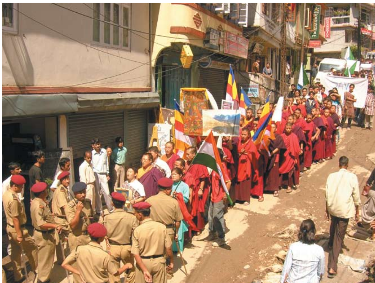
Protest against the Teesta Dams in Sikkim, India, 2007. In 2007, the Affected Citizens of Teesta staged a relay hunger strike against the projects for more than 500 days.

These and other trans-boundary water issues in the whole region will benefit tremendously from such network-building between civil society and affected people's groups from all the countries in the region.