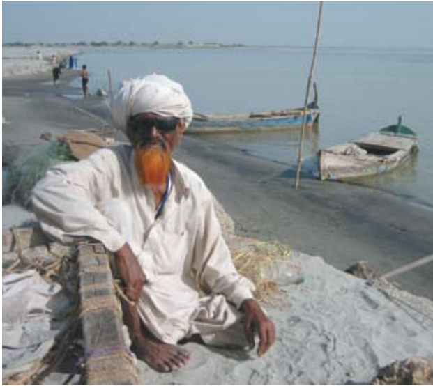
Fisherman on the Indus River, Pakistan, 2007. The planned hydropower projects are likely to submerge forests, farms and grazing lands, impact fisheries, cut-off access roads, and degrade water sources impacting millions of people along the way.

Consider the 2,000 MW Lower Subansiri project in Arunachal Pradesh, India, which is under construction. The people of Durpai Village, one of the affected villages, say that while two villages are shown to be losing land to submergence, many other villages and people will also be affected because their rice growing areas are affected by the project. They also say that the project requires 40 km 2 (4,000 ha) of forests, much of it for submergence. This forest area supports part of the shum cycle of the local people, in addition to being a source of many other goods and services.