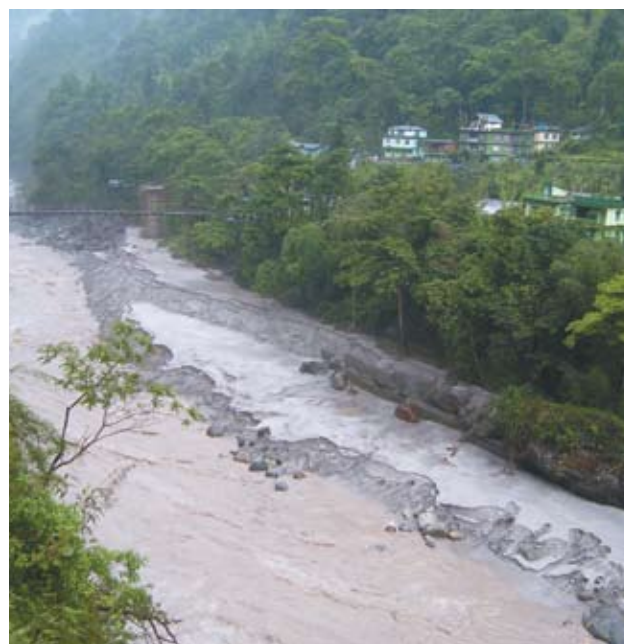
Silt accumulation upstream of Teesta V Dam, 2008. Siltation is a serious issue as it affects the performance and life of a project, and also deprives downstream plains of nutrients that have been the source of their fertility.

The impacts from transmission line construction will be an important issue in Pakistan, Nepal and Bhutan. A major impact will be felt in India in the Siliguri Corridor or “Chicken’s neck” – the area between Siliguri and Bidhan Nagar in West Bengal – which is the only connection from the Indian mainland to the states in the northeast. This area is the only way to transmit power from Bhutan to India, and from India’s northeast to the rest of the country; the transmission lines will have to be bunched together here. The Working Group on Power for the 11 th Five Year Plan in India estimates that to transmit all the surplus power from northeastern India and Bhutan will require a set of transmission lines with a right of way about 1.5 km wide. 109